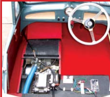
The seats can be removed to gain access the engine.

in our neighbourhood and more widely. It was much admired by a local retired policeman, but he was quick to add: 'Don't you ever take it on the road or even think of using it on the pavement!' It received its first public outing at Manchester Branch's Winter Rally at Manchester Museum of Transport, where it proved quite an attraction parked next to a 'real' 1956 Clarendon Grey four-door saloon.