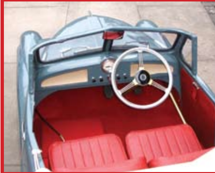
Good matches: an Austin J40 steering wheel, and speedometer from a Puch Maxi moped.