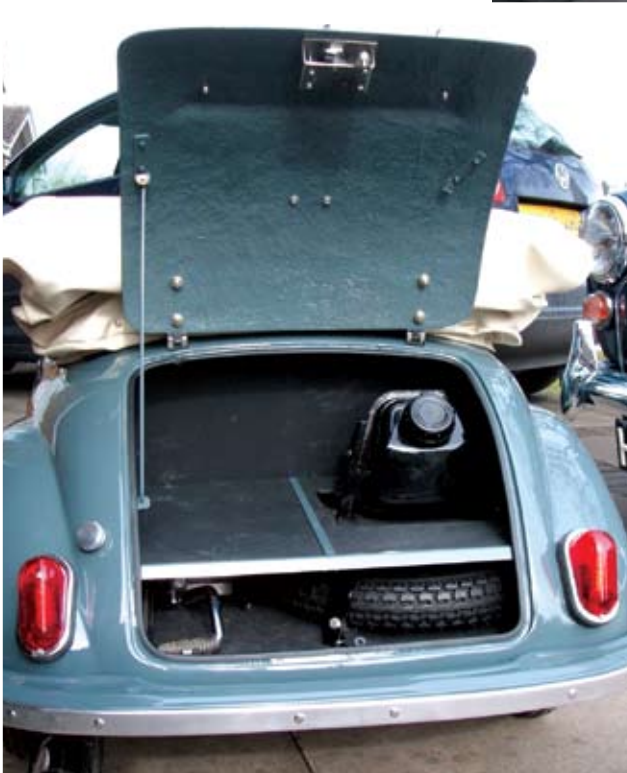
TOP Not an exact scaled-down replica: the dimensions of the little car were subtly altered.