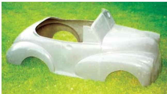
The bodyshell, one of a batch manufactured to Jim Lambert's design.

At the end of my garden is a shed, known rather grandly as 'The Workshop'. It's not very big, but it has an electricity supply and a good six-inch vice bolted to a sturdy wooden workbench. There is also a small bench grinder, useful for keeping tools sharp. Otherwise all the equipment is man-powered, except for an electric bench drill which replaced a 'handraulic' bench drill a couple of years ago. There is a small metal-cutting lathe that is treadle-driven and which recently celebrated its centenary — without a telegram from the Queen, I would add. Finally there is a pre-war hand-driven shaping machine that, like the lathe, requires good muscles, acquired skill and plenty of patience when used for cutting metal. All in all, it's a rather motley collection but nonetheless a useful one.