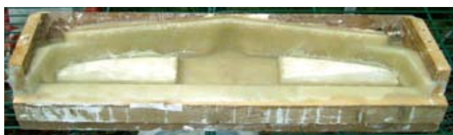
Fibreglass laid up in the dashboard mould.