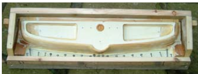
The wooden pattern for the dashboard: plaster of Paris was poured around the pattern to make a mould.