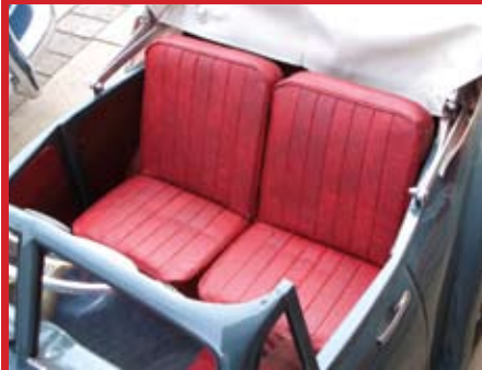
Alan made the seat covers himself using Gill's domestic sewing machine.